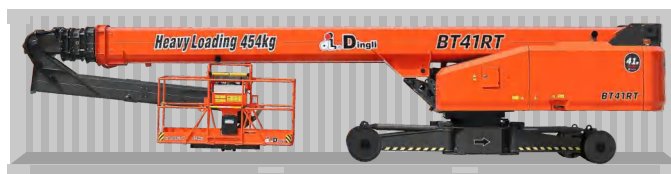
Standard Container Transport