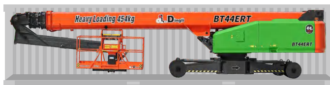
Standard Container Transport