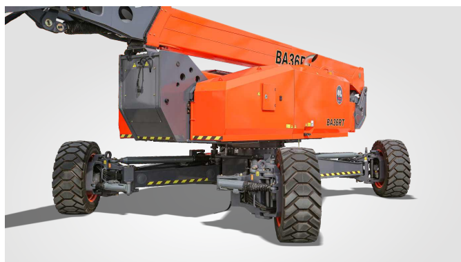
Brand New One-Key In-Situ Axle Expansion Technology Global Patent Protection