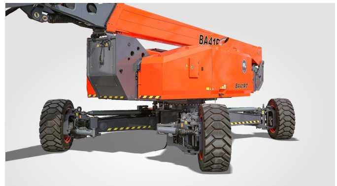
Brand New One-Key In-Situ Axle Expansion Technology Global Patent Protection